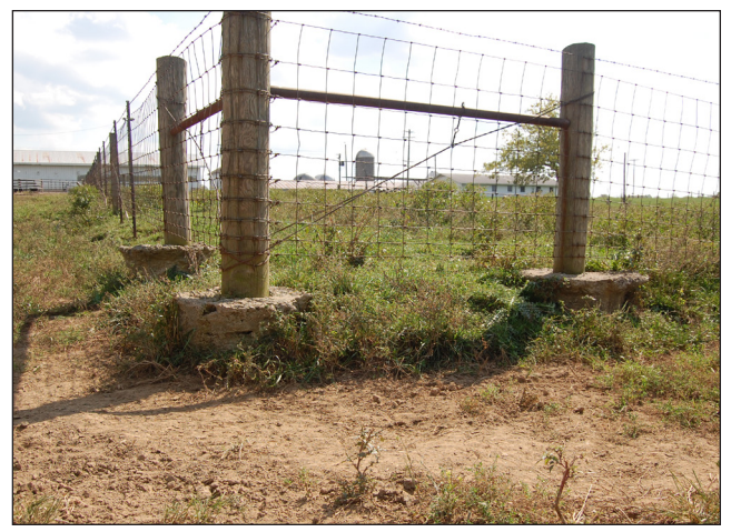
Figure 2. Livestock commonly create paths around obstacles in a field, such as internal corner posts.