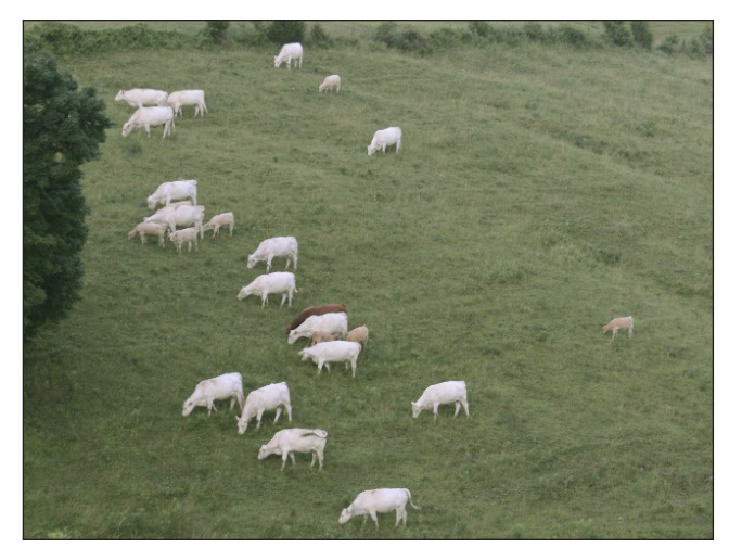
Figure 1. One animal typically occupies a grazing trail. These trails allow the animals to graze the upper slope and provide grazing and energy efficiency.

An actual tire cylinder may be approximately 40 inches in diameter, but the removal of the tire sidewall will enable the tire cylinder to fit within a 36-inch-wide trench. Nonwoven geotextile fabric should be placed in the bottom of the trench (Figure 4). This material is needed to provide the drainage, reinforcement, friction, and separation necessary for structural integrity. The tread cylinders are then placed end to end, on top of the geotextile fabric (Figure 4). A suitable rock material, such as dense-grade aggregate (DGA), is then placed inside and around the tire voids (Figure 5). The top edge of the tire cylinder should be at grade level or a little higher (Figure 6).