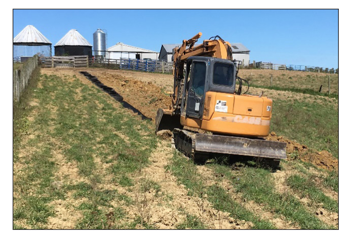
Figure 3. A backhoe creates a trench for the all-weather path.