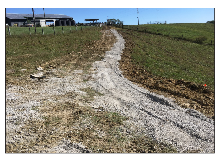
Figure 6. A completed trail leads to a water source located on a hill with 30-percent slopes.