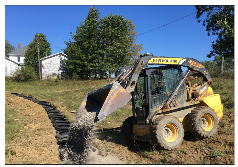
Figure 5. The tread cylinders are filled with rock.

The effort required to install an all-weather surface trail for grazing animals will not be wasted. Grazing animals and their offspring can be seen using these trails during all times of the year (Figure 7). These trails provide energy efficiencies for animals, particularly during wet weather periods.