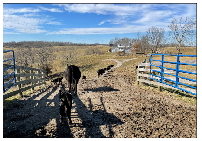
Figure 7. Cattle use an all-weather surface path to get to and from a water source.

Educational programs of Kentucky Cooperative Extension serve all people regardless of economic or social status and will not discriminate on the basis of race, color, ethnic origin, national origin, creed, religion, political belief, sex, sexual orientation, gender identity, gender expression, pregnancy, marital status, genetic information, age, veteran status, or physical or mental disability. Issued in furtherance of Cooperative Extension work, Acts of May 8 and June 30, 1914, in cooperation with the U.S. Department of Agriculture, Nancy M. Cox, Director of Cooperative Extension Programs, University of Kentucky College of Agriculture, Food and Environment, Lexington, and Kentucky State University, Frankfort. Copyright © 2021 for materials developed by University of Kentucky Cooperative Extension. This publication may be reproduced in portions or its entirety for educational or non-profit purposes only. Permitted users shall give credit to the author(s) and include this copyright notice. Publications are also available on the World Wide Web at www.ca.uky.edu. Issued 12-2021